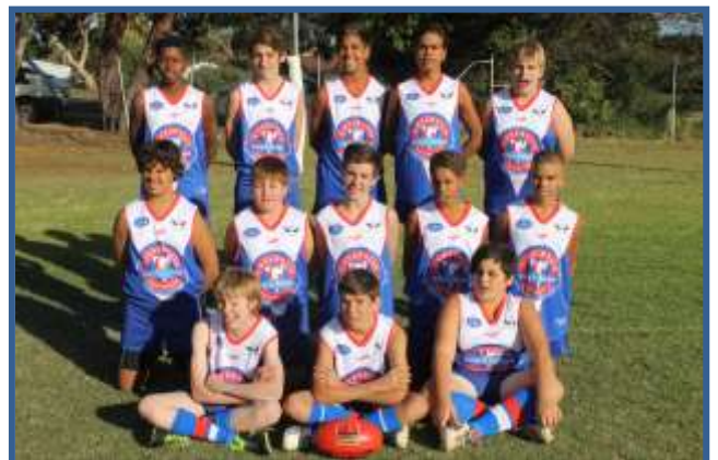
JUNIOR SCHOOL AFL TEAM