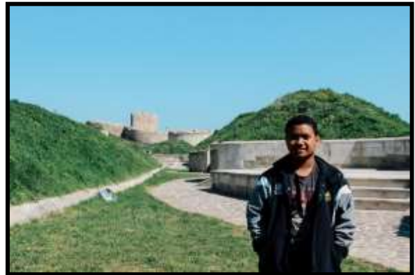
At Turkish Fort