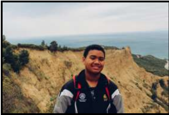
Above the Sphinx, Gallipoli