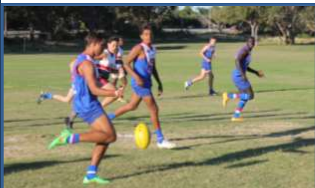
SENIOR SCHOOL TEAM IN ACTION